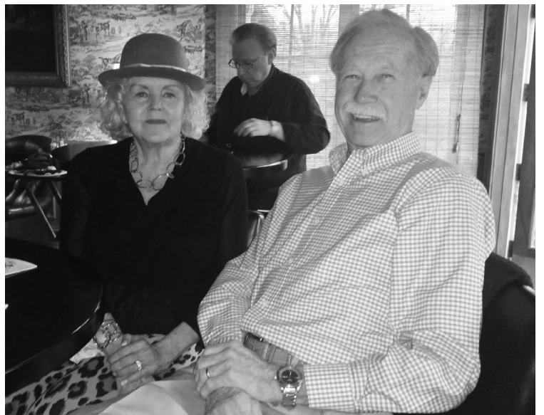
Dance Club Night